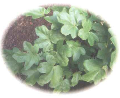
FIELD MAPLE - Acer campestre

FIELD MAPLE - These generally form a smallish tree and are found scattered through the woodlands, especially near the edges. Good for wildlife and lichens.