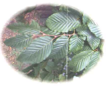
HORNBEAM - Carpinus betulus

HORNBEAM - Very common in the woodlands, mostly as overstood coppice - that is old coppice. It is likely that hornbeam coppice was used to produce charcoal - perhaps for gunpowder production at the dockyards. Hornbeam readily propagates from seed and plenty of saplings can be found in the woods. The fruits of the hornbeam are favoured by Hawfinches.