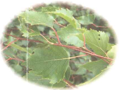
BIRCH - Betula pendula

BIRCH - Tends to be found on more acid soil areas of the woodlands. Birch is relatively quick growing and is excellent for moths and its seeds are eaten by many birds.