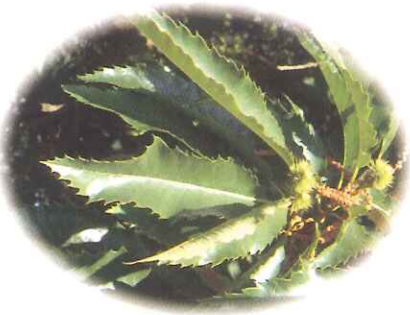
SWEET CHESTNUT - Castanea sativa

SWEET CHESTNUT - Found in just one area of the woodlands, this tree was introduced by the Romans. It was planted extensively and coppiced for firewood and fencing stake production. It flowers after its leaves have opened - usually late May or June.