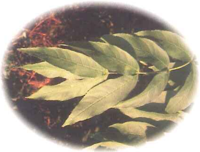
ASH - Flaxinus excelsior

ASH - Many large standards, younger trees and saplings throughout the woods. Ash is an early coloniser and provides food for privet hawk moths.