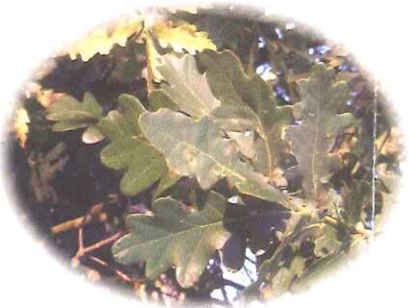
OAK - Quercus robur

OAK - Most of the oak in the woodlands is common or Quercus robur , also referred to as Pedunculate oak (because its acorns are carried on long stalks). Oak is an excellent tree for wildlife and supports a wide range. Oaks have separate male & female flowers appearing in the same tree.