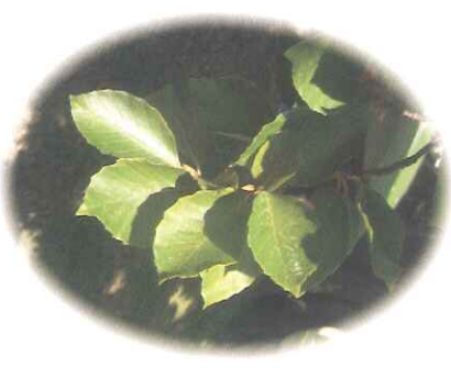
BEECH - Fagus sylvatica

BEECH - There are still a few large beech standards left within the woods, but many were destroyed by the 1987 hurricane. The beechnuts are eaten by mammals and birds. Instantly recognisable by its smooth bark.