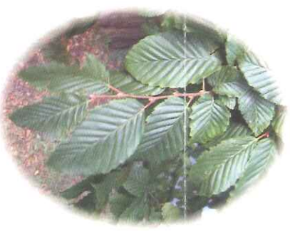
HORNBEAM - Carpinus betulus

HORNBEAM - Very common in the woodlands, mostly as overstood coppice - that is old coppice. It is likely that hornbeam coppice was used to produce charcoal - perhaps for gunpowder production at the dockyards. Hornbeam readily propagates from seed and plenty of saplings can be found in the woods. The fruits of the hornbeam are favoured by Hawfinches.