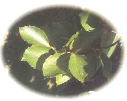
BEECH - Fagus sylvatica

BEECH - There are still a few large beech standards left within the woods, but many were destroyed by the 1987 hurricane. The beechnuts are eaten by mammals and birds. Instantly recognisable by its smooth bark.