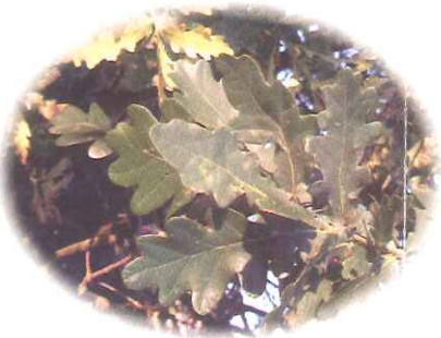
OAK - Quercus robur

OAK - Most of the oak in the woodlands is common or Quercus robur , also referred to as Pedunculate oak (because its acorns are carried on long stalks). Oak is an excellent tree for wildlife and supports a wide range. Oaks have separate male & female flowers appearing in the same tree.