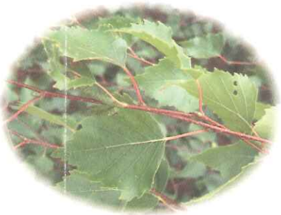
BIRCH - Betula pendula

BIRCH - Tends to be found on more acid soil areas of the woodlands. Birch is relatively quick growing and is excellent for moths and its seeds are eaten by many birds.