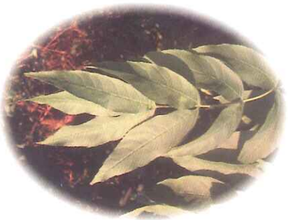
ASH - Fraxinus excelsior

ASH - Many large standards, younger trees and saplings throughout the woods. Ash is an early coloniser and provides food for privet hawk moths.