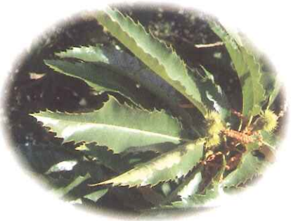
SWEET CHESTNUT - Castanea sativa

SWEET CHESTNUT - Found in just one area of the woodlands, this tree was introduced by the Romans. It was planted extensively and coppiced for firewood and fencing stake production. It flowers after its leaves have opened - usually late May or June.