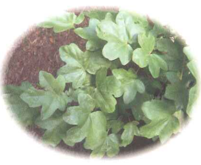
FIELD MAPLE - Acer campestre

FIELD MAPLE - These generally form a smallish tree and are found scattered through the woodlands, especially near the edges. Good for wildlife and lichens.