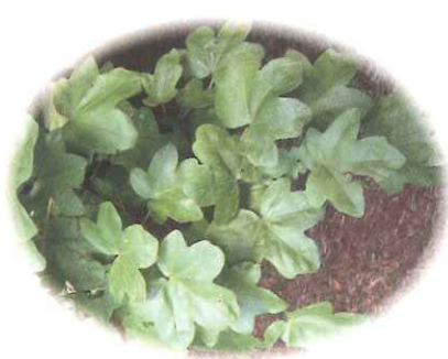
FIELD MAPLE - Acer campestre

FIELD MAPLE - These generally form a smallish tree and are found scattered through the woodlands, especially near the edges. Good for wildlife and lichens.