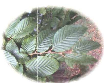
HORNBEAM - Carpinus betulus

HORNBEAM - Very common in the woodlands, mostly as overstood coppice - that is old coppice. It is likely that hornbeam coppice was used to produce charcoal - perhaps for gunpowder production at the dockyards. Hornbeam readily propagates from seed and plenty of saplings can be found in the woods. The fruits of the hornbeam are favoured by Hawfinches.