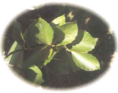
BEECH - Fagus sylvatica

BEECH - There are still a few large beech standards left within the woods, but many were destroyed by the 1987 hurricane. The beechnuts are eaten by mammals and birds. Instantly recognisable by its smooth bark.