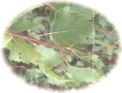
BIRCH - Betula pendula

BIRCH - Tends to be found on more acid soil areas of the woodlands. Birch is relatively quick growing and is excellent for moths and its seeds are eaten by many birds.