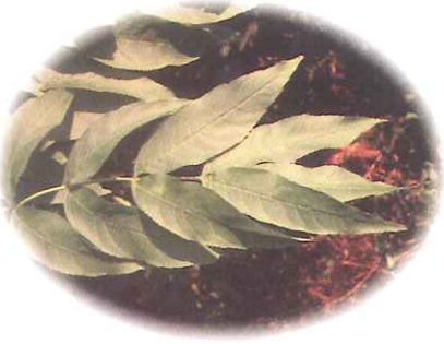
ASH - Fraxinus excelsior

ASH - Many large standards, younger trees and saplings throughout the woods. Ash is an early coloniser and provides food for privet hawk moths.