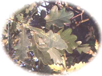
OAK - Quercus robur

OAK - Most of the oak in the woodlands is common or Quercus robur , also referred to as Pedunculate oak (because its acorns are carried on long stalks). Oak is an excellent tree for wildlife and supports a wide range. Oaks have separate male & female flowers appearing in the same tree.