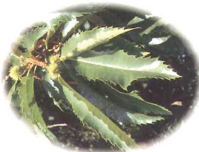
SWEET CHESTNUT - Castanea sativa

SWEET CHESTNUT - Found in just one area of the woodlands, this tree was introduced by the Romans. It was planted extensively and coppiced for firewood and fencing stake production. It flowers after its leaves have opened - usually late May or June.